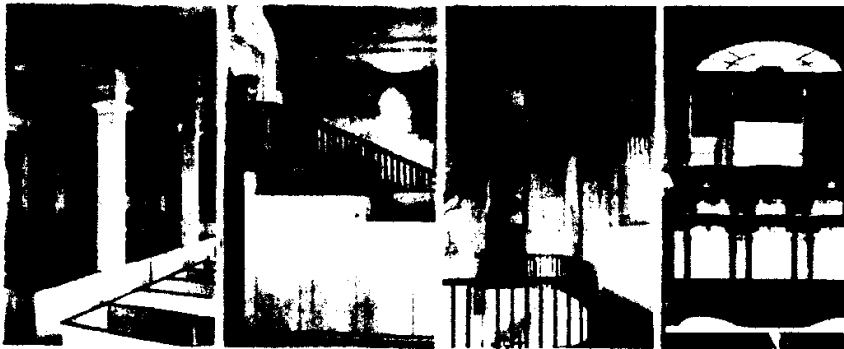
Interior of the Kirtland Temple in Ohio.